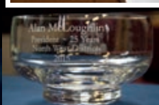
A presentation was made to the District President in recognition of 25 years service as President.