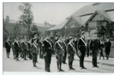
1st Port Sunlight outside Gladstone Hall in 1900, then one of the village schools. The Company was formed in 1900.