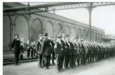
Members of the 1st Port Sunlight assembled in the works sidings to receive King George V and Queen Mary on the Royal train on March 25th 1914 when they visited the village to lay the foundation stone of the Lady Lever Art Gallery. (A British Pathé clip captures the prominent part played by the Company).