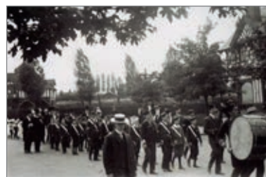
1st Port Sunlight lead a village occasion