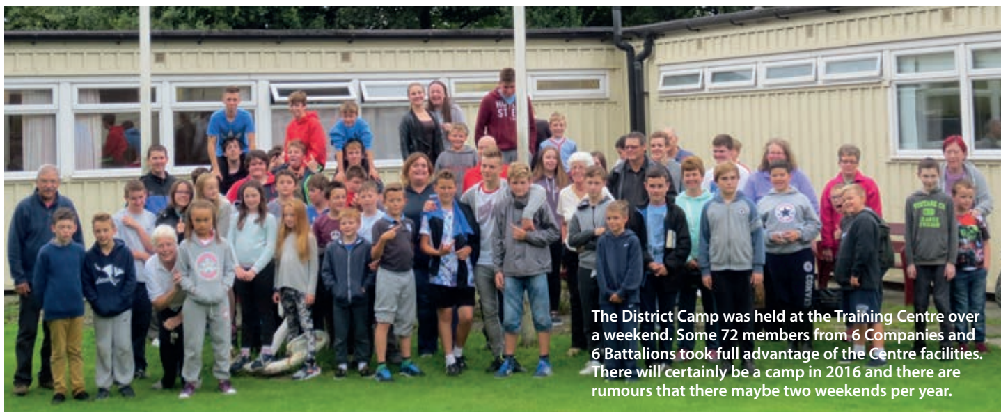
The District Camp was held at the Training Centre over a weekend. Some 72 members from 6 Companies and 6 Battalions took full advantage of the Centre facilities. There will certainly be a camp in 2016 and there are rumours that there may be two weekends per year.