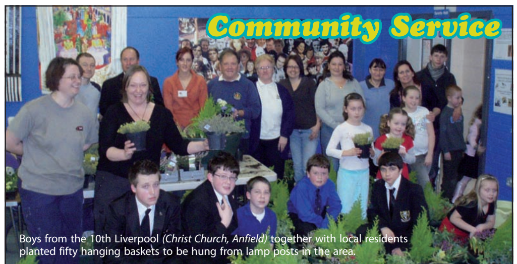
Boys from the 10th Liverpool ( Christ Church, Anfield ) together with local residents planted fifty hanging baskets to be hung from lamp posts in the area.