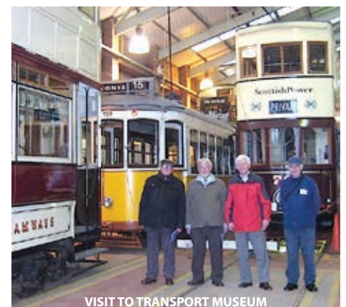
VISIT TO TRANSPORT MUSEUM