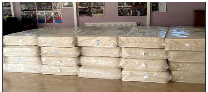
New Mattresses for Beds in Centenary Hall