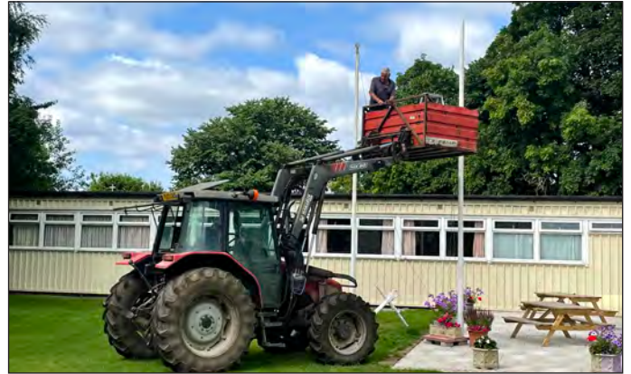
Finial Restored to Flagpole