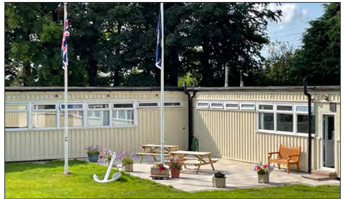
Refurbishment of Flagpole Patio area