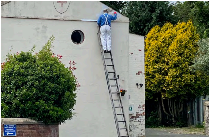
Painting - The House and Stedfast Lodge have been painted