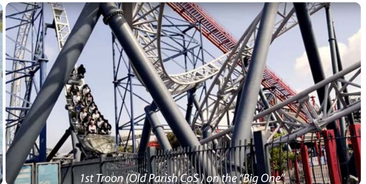
1st Troon (Old Parish CoS) on the 'Big One'