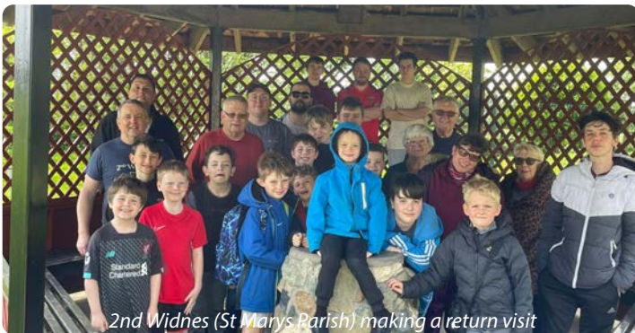
2nd Widnes (St Marys Parish) making a return visit