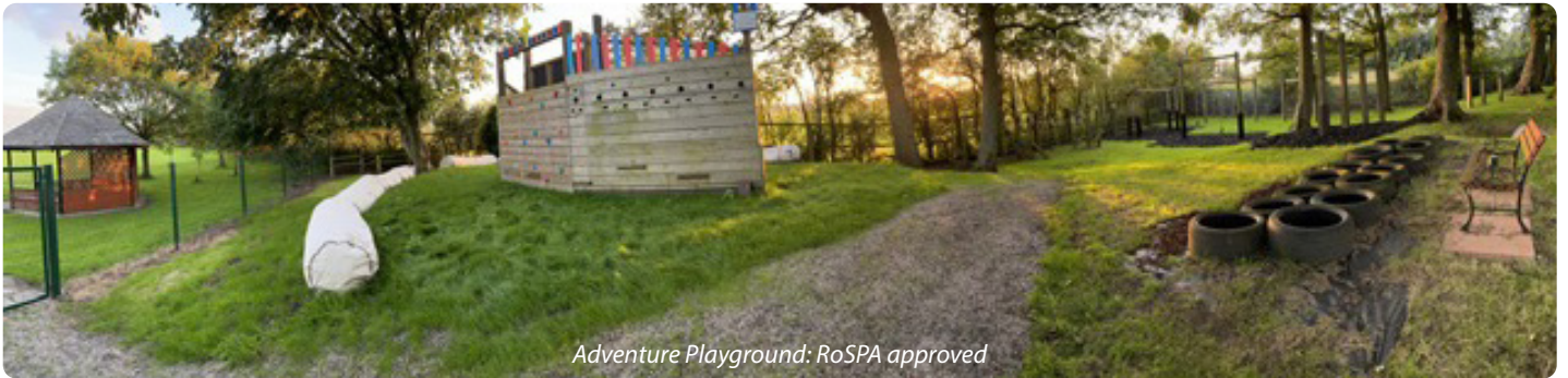
Adventure Playground: RoSPA approved

This summer has seen a return of pre pandemic usage of the centre, parties in some cases bringing smaller numbers but BB bookings from our own District and the wider Brigade remain in the the majority, which is encouraging in that, we are able to support Companies to provide meaningful activities. We continue to receive compliments as to the overall quality of what is provided, the recent RoSPA inspection of the Adventure Playground allowed to us open up the full facility in time for the season.