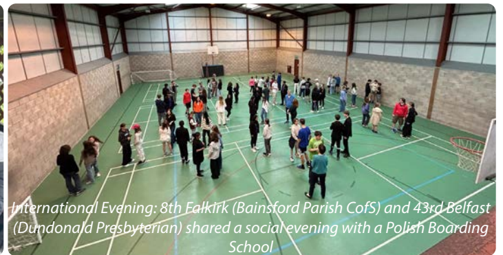
International Evening: 8th Falkirk (Bainsford Parish CofS) and 43rd Belfast (Dundonald Presbyterian) shared a social evening with a Polish Boarding School