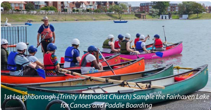
1st Loughborough (Trinity Methodist Church) Sample the Fairhaven Lake for Canoes and Paddle Boarding