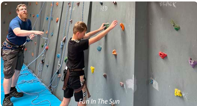
Fun In The Sun