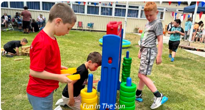
Fun In The Sun